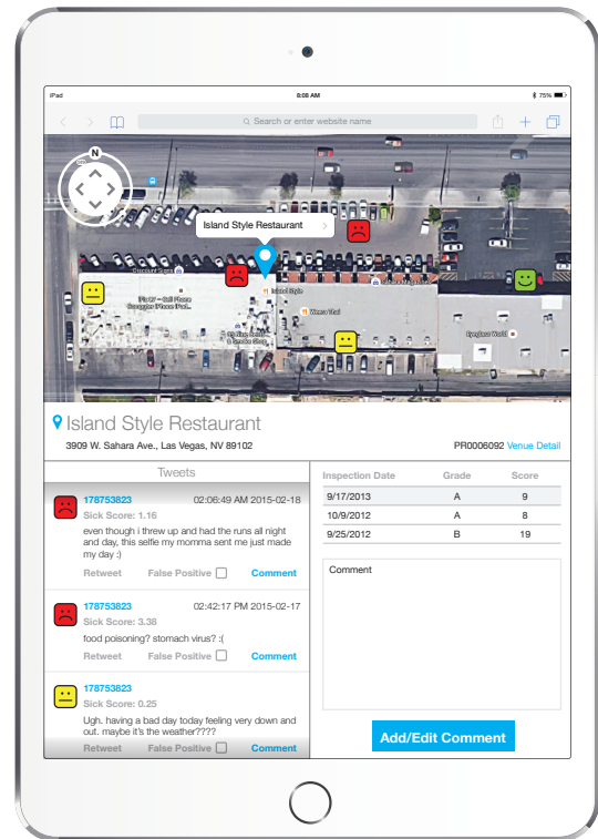
Figure 1: nEmesis web interface. The top window shows a portion of the list of food venues ranked by the number of tweeted illness self-reports by patrons. The bottom window provides a map of the selected venue, and allows the user to view the specific tweets that were classified as illness self-reports.